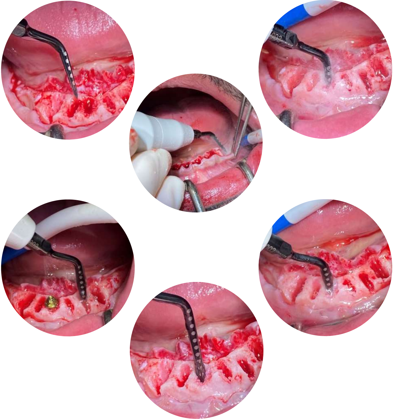
Preparation of the implant site with micro-sharpened inserts ES052XGT and ES0DCLT .